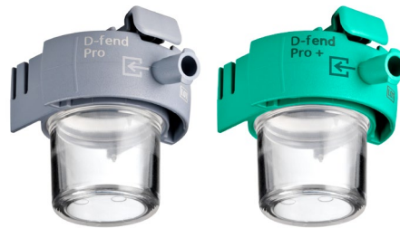
Figure 1. The D-Fend Pro and D-Fend Pro+ water traps

The D-Fend™ Pro is a water trap used with the single-width CARESCAPE™ respiratory modules, see figures 1 and 2. With its special polytetrafluoroethylene (PTFE) membrane, the water trap is designed to protect the modules from moisture, humidity and contaminants, which can harm the gas bench and affect measurement accuracy. A study was conducted by an independent research facility to test the water trap's particle separation ability, using particles of different sizes. Results showed that the D-Fend Pro water trap separated at least 99.98% of the particles with a particle size as small as 0.15 µm. Bacteria typically has a particle size of 0.5 µm to 5 µm. 1