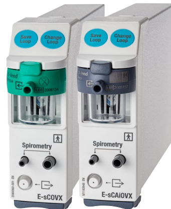
Figure 2. CARESCAPE respiratory modules